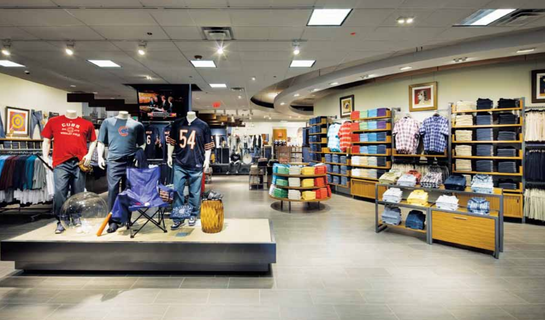
Upon entering the space, quality cues, visual runways, bold presentation of key items and a pivotal hub establish the visual and merchandising hierarchy