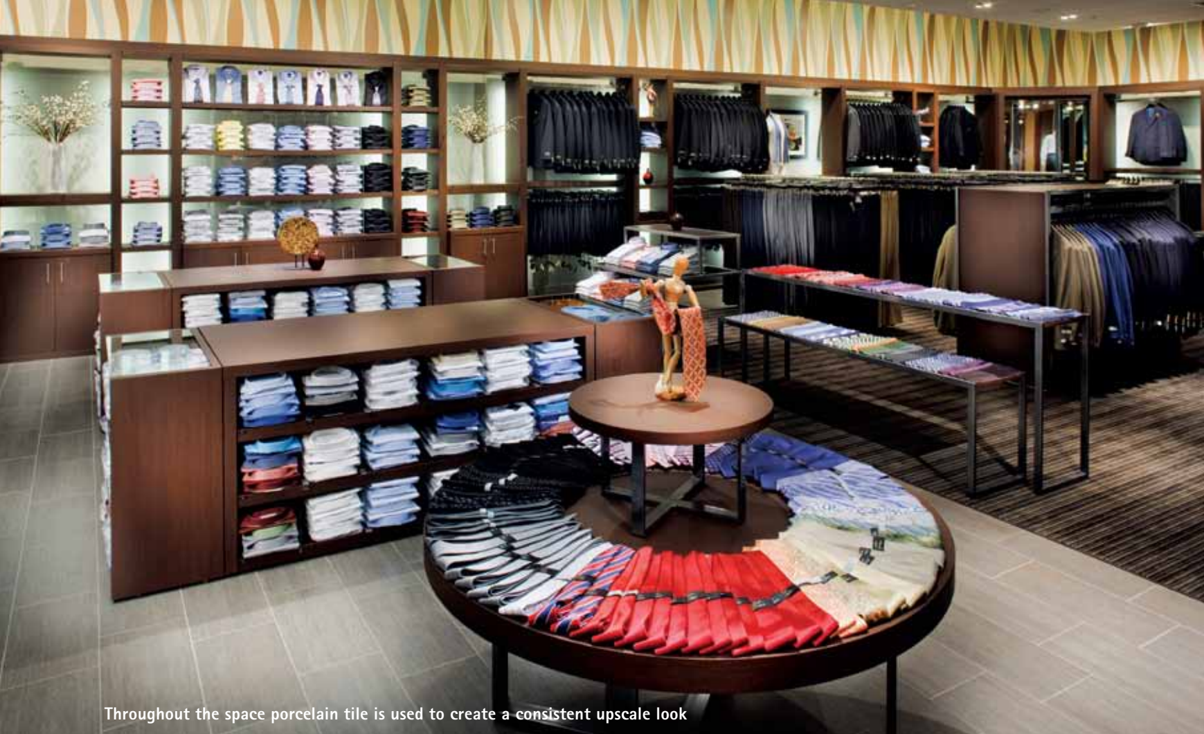
Throughout the space porcelain tile is used to create a consistent upscale look