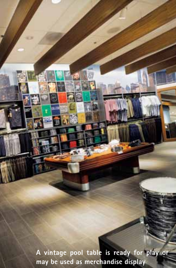
A vintage pool table is ready for play or may be used as merchandise display

At the Active zone, the runway has a multisport technical finish and a series of actively engaged forms and mannequins. The zone's focal wall creates a skybox view through its stadium architecture and backlit illuminated graphics. In Studio, a denim bar is featured, constructed of end block rustic timber on a raw steel base. A runway feature, with its diamond metal top and raw welded steel frame, is accented with an array of vintage bulb and cast glass decorative lighting. Stock shelving wall fixtures frame a graphic t-shirt focal element, with ceiling suspended timbers providing a secondary ceiling surface in keeping with the area's loft-like setting. Adding to this, a vintage pool table is ready for play or may be used as merchandise display.