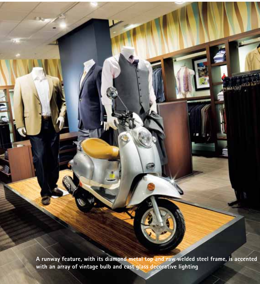
A runway feature, with its diamond metal top and raw welded steel frame, is accented with an array of vintage bulb and cast glass decorative lighting

Upon entering the space, quality cues, visual runways, bold presentation of key items and a pivotal hub establish the visual and merchandising hierarchy that is at one hand distinctive for each department in terms of finishes, tone and feel, and yet consistent among the areas to provide continuity, consistency and a familiarity for the guest.