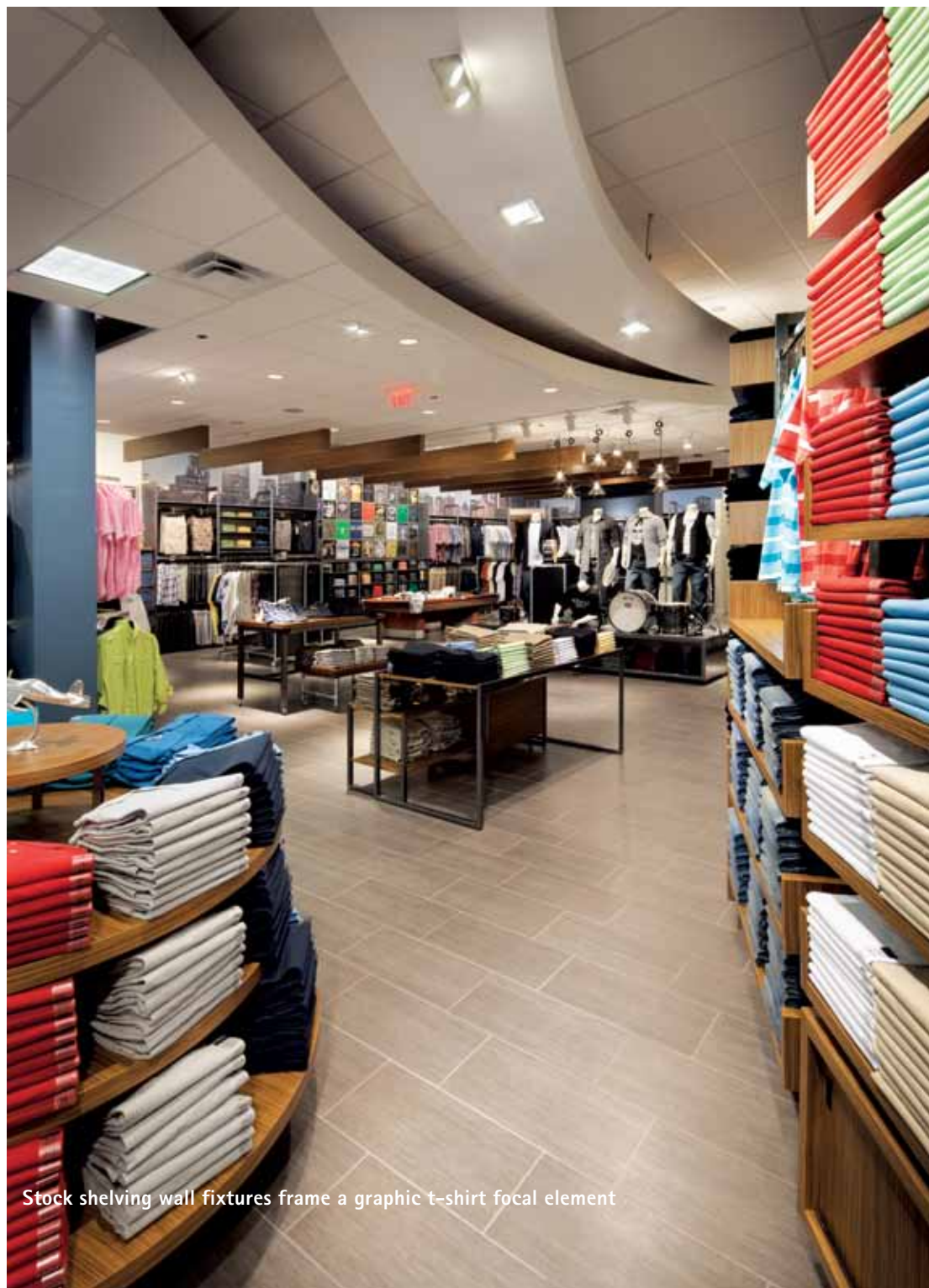
Stock shelving wall fixtures frame a graphic t-shirt focal element