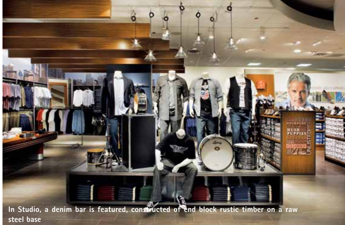
In Studio, a denim bar is featured, constructed of end block rustic timber on a raw steel base

The Essentials zone at the store's hub provides major impact walls for merchandising key